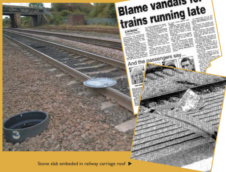
Stone slab embedded in railway carriage roof

Objects do not have to be very big to create the potential for de-railing a train, causing injury and death.