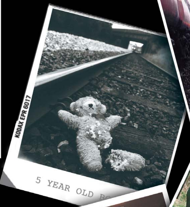
KODAK EPR 6017