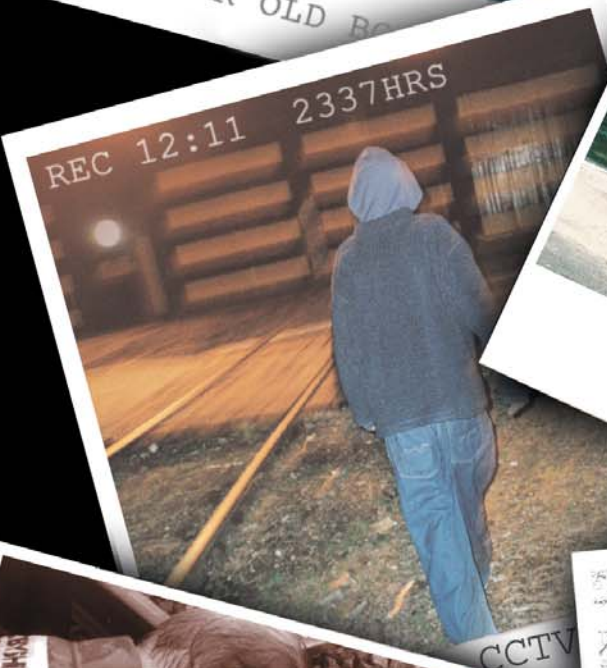
REC 12:11 2337HRS