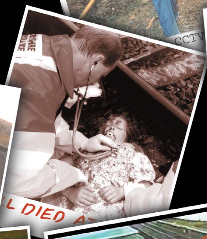
CHILD DIED AT