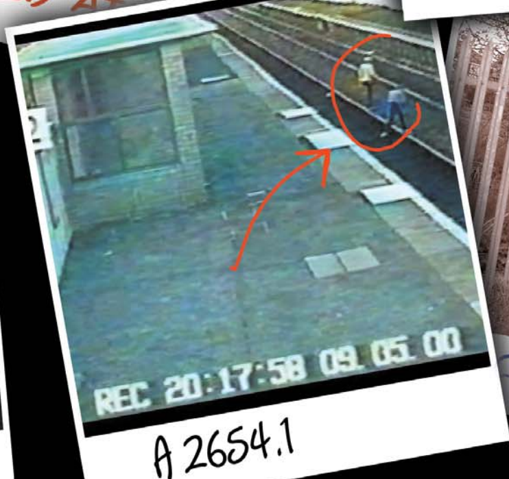
REC 20:17:58 09 05 00