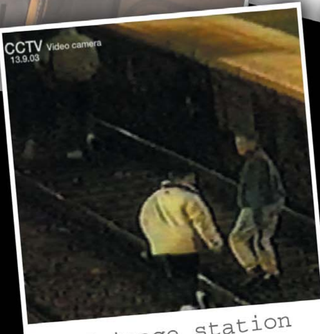
CCTV Video camera 13.9.03