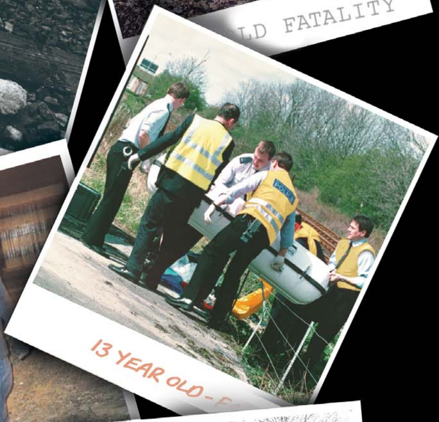
13 YEAR OLD - FATALITY