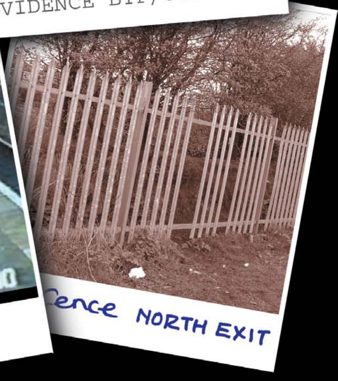
Fence NORTH EXIT