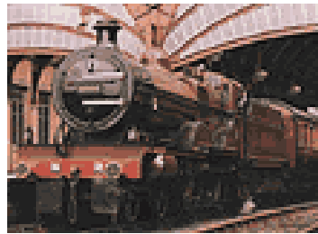
Midland Railway, 1914

The railways possessed some 23,000 locomotives, nearly 73,000 carriages and 1.4 million goods wagons. This size of network was to serve Britain well moving troops around the country to the various embarkation points for the war on the mainland of Europe. Working the railways under a central Government committee during the war revealed how wasteful cut-throat competition between over 100 companies had been.